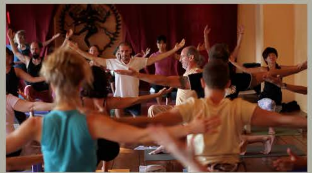
Asana as part of the Yoga Journey

The combination of yogic contemplation and exercise produces a deep experience!